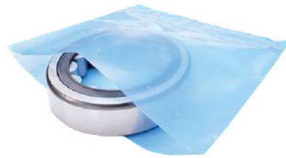
VCI FILM POUCH