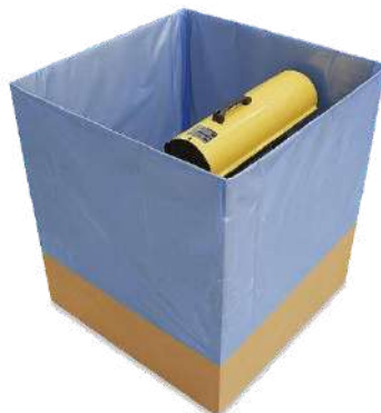
VCI FILM BAG