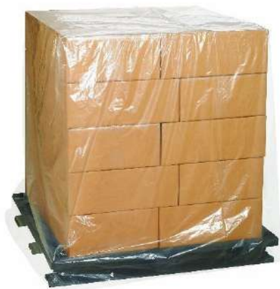
LDPE PALLET COVER

For parts, bulk material, machinery, switch cabinets, devices, plant technology, heavy and bulky industrial goods