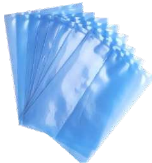
VCI FILM SHEET