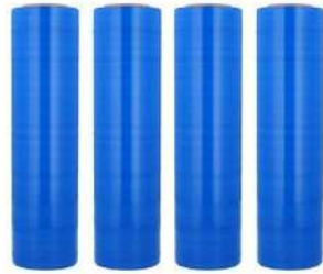
VCI FILM ROLL

The surface layer thus formed disrupts the chemical and electrochemical reactions that provoke corrosion. When VCI packaging is opened, the VCI film vaporizes without leaving any